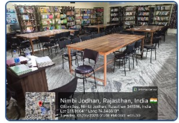
Library View 2