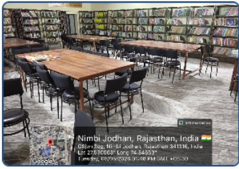
Library View 1