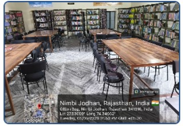
Library View 3